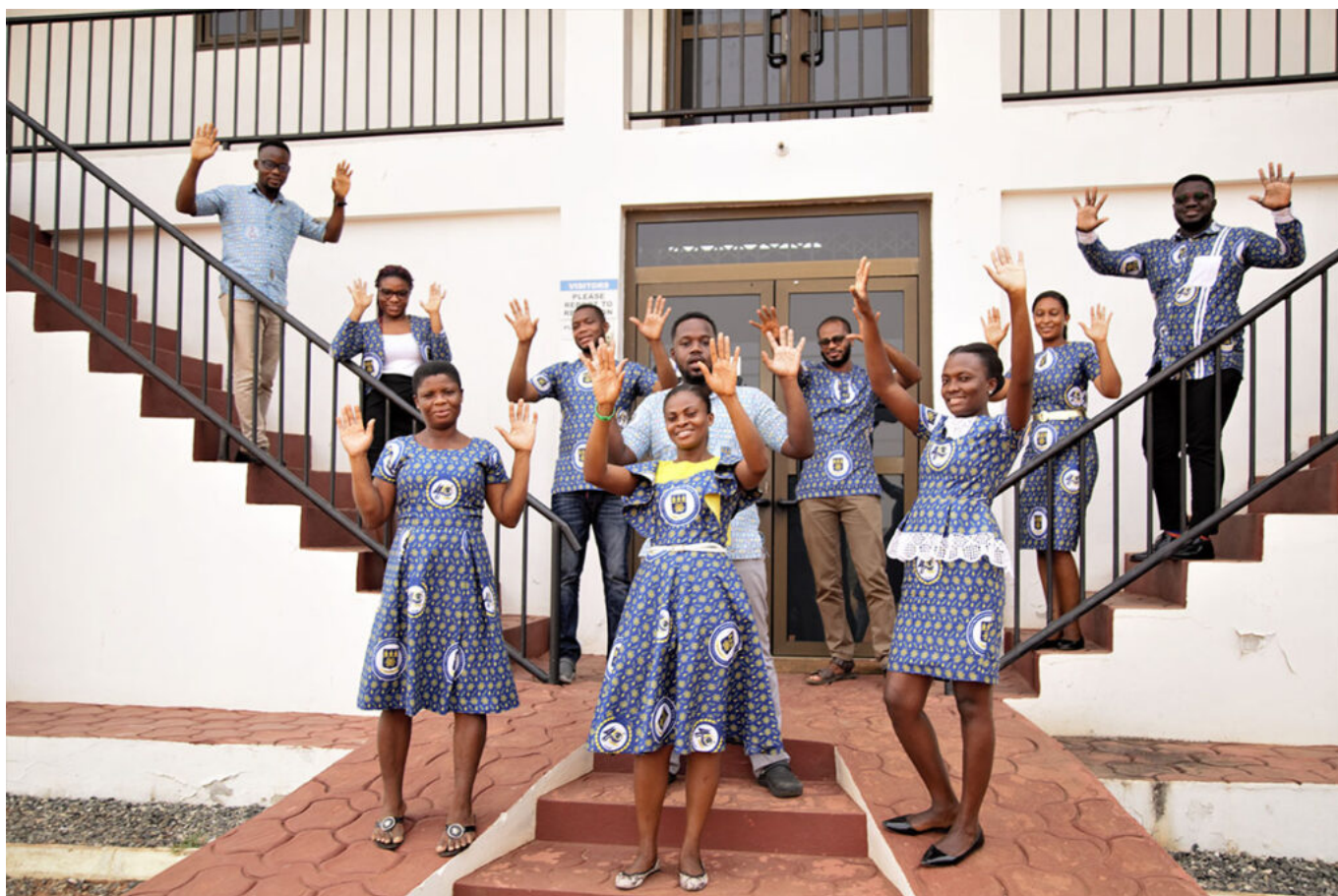
The VNVL team celebrates their 10th anniversary in November 2021

“A lot of our staff are graduates of Ghanaian universities. We believe in developing young scientists, that’s been part of the partnership with NMIMR.”